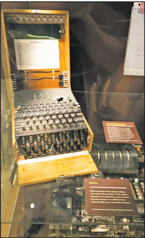
Enigma machine at Bletchley Park.

Sir Ian Fleming was also at Bletchley Park during WWII. He was a spy and later inspired the James Bond series.