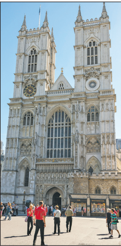
Westminster Cathedral, London – Band members in distinctive red shirts.